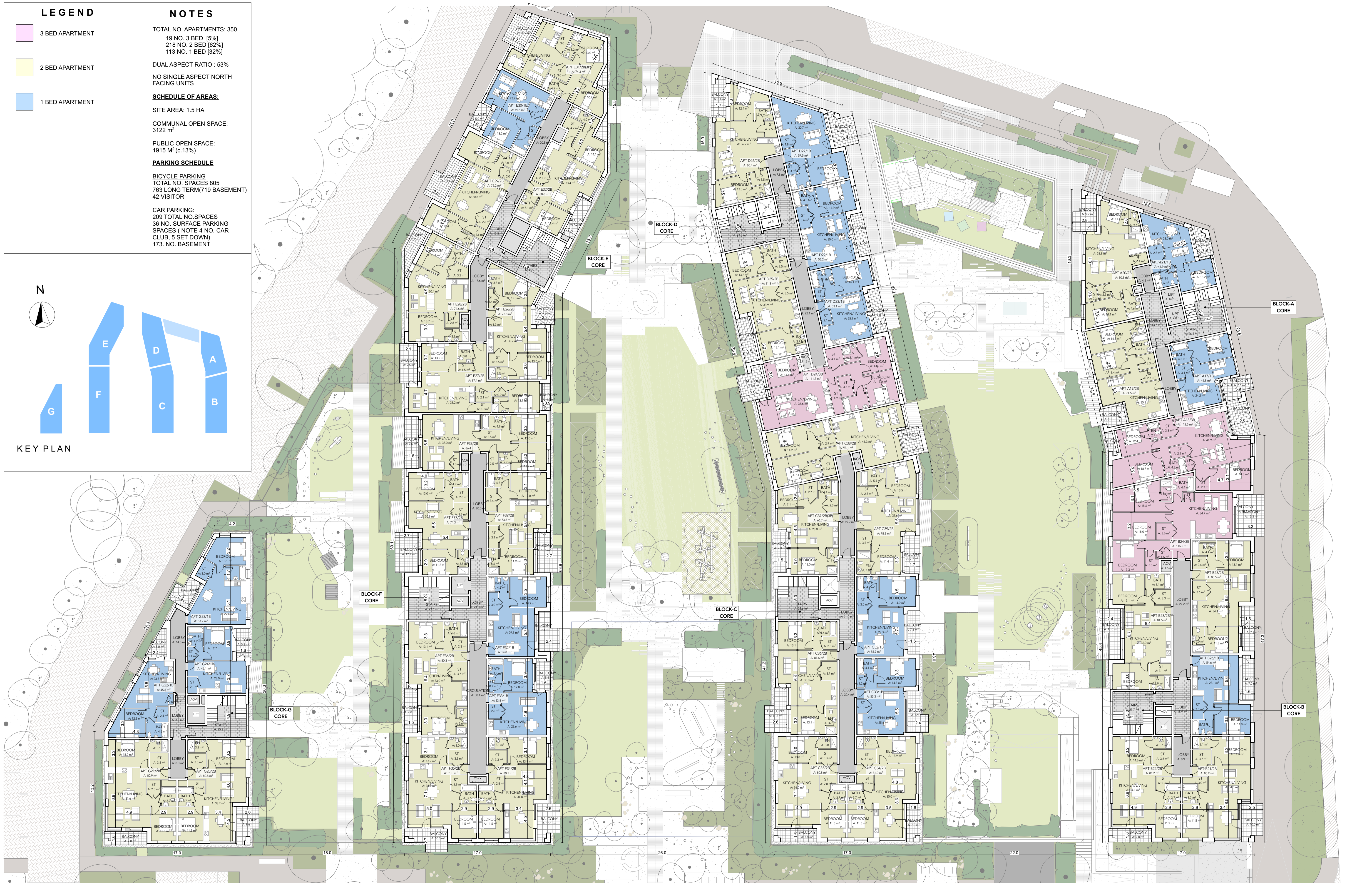
Fourth Floor Plan SCALE : 1:200